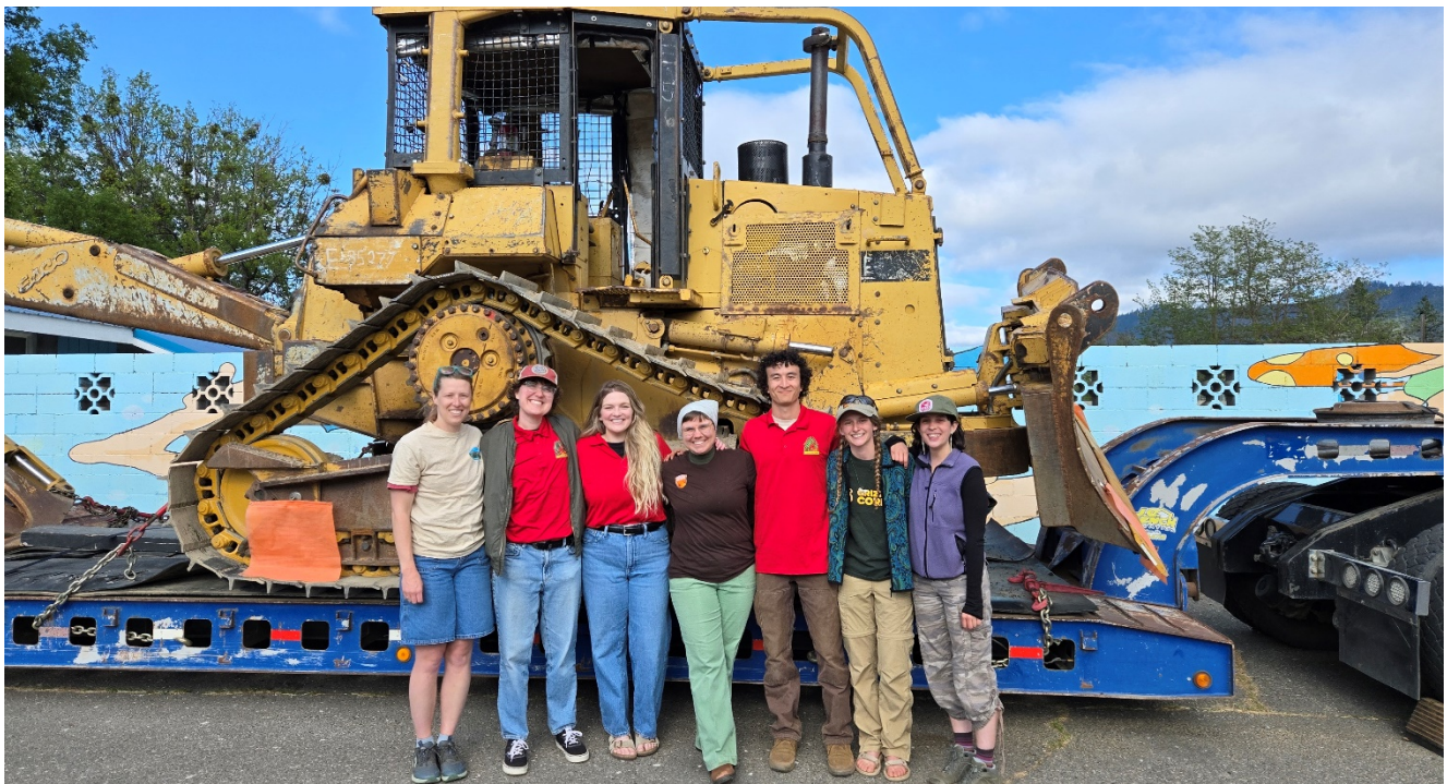
Figure 2 Trinity County RCD staff and GrizzlyCorps Fellows posing in front of the Touch-a-Truck activity