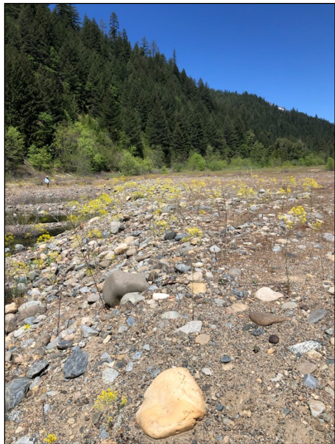
Dyer's woad in the process of being removed at Carrville Ponds.