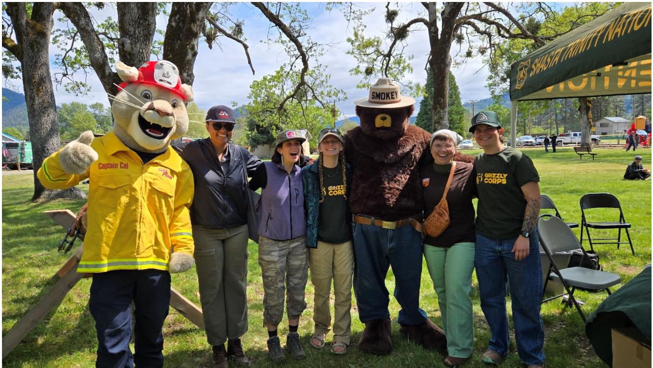
Figure 3 Both CALFIRE's Captain Cal and the US Forest Service's Smokey Bear made an appearance