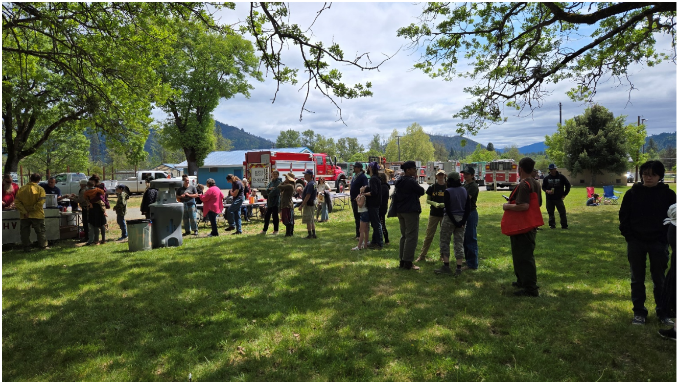
Figure 1 The Hayfork Volunteer Fire Department's tacos were a hit!