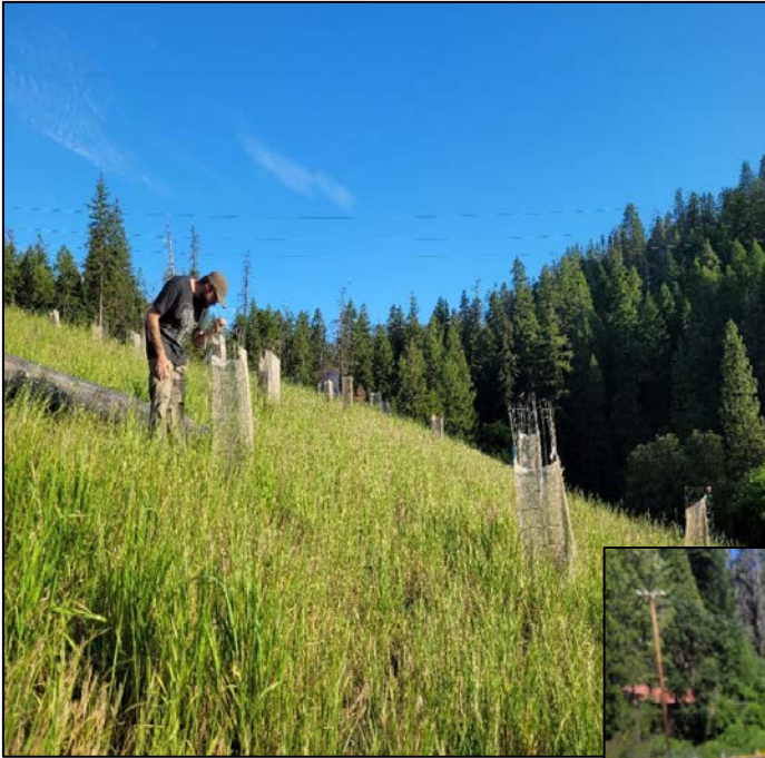
(Top) Karl Reisinger assisting with assessing spring plant survival and oak germination at the Ditch Gulch revegetation site; (Right) native plants flowering at the Swift Creek revegetation site.