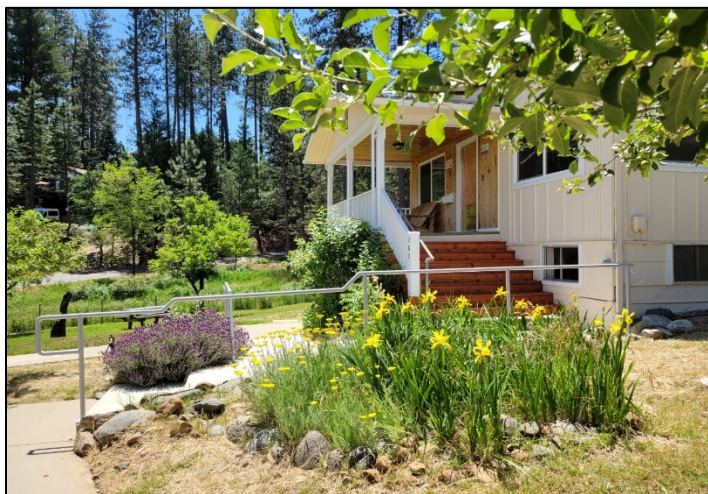
(Top) The Young Family Ranch house grounds in June 2022; (Right) a freshly-planted Community Garden plot.