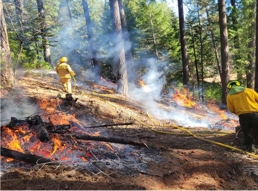
Trinity Knolls Burn on April 15