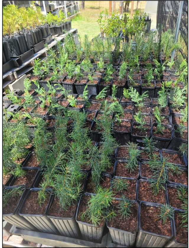
Donated conifers freshly transplanted at the Native Plant Nursery.