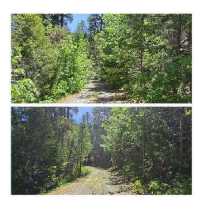
Before and after road was masticated – 28N71