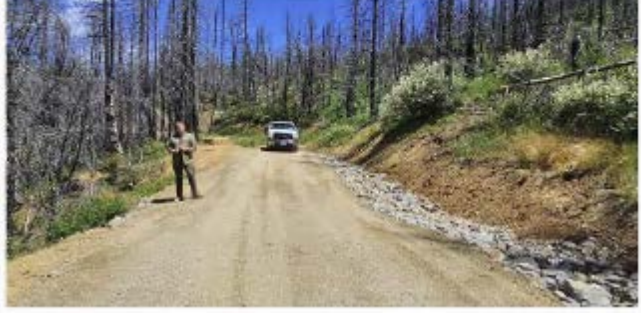
Perforated pipe drains, then rip rap installed in ditch and across road to improve drainage at spring