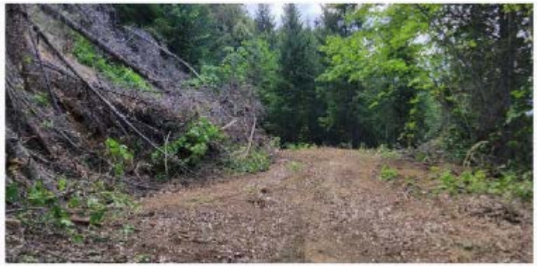
Before and after clearing 5N04 road