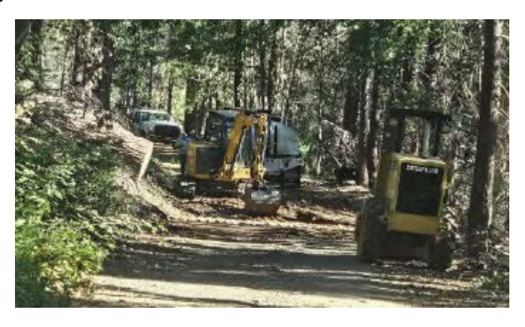
July 17, 2024