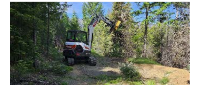
Masticating 28N71 Road which accesses Dog Gulch Trail

Staff Report: Management: 2 Crew: 1 Contractors: 5