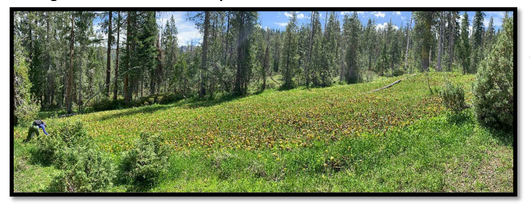
Figure 1. WRTC staff Alexa Delaqua takes a photo of the field of California Pitcher Plants ( Darlingtonia californica) in an alpine meadow in Mumbo Basin. 6/25/24