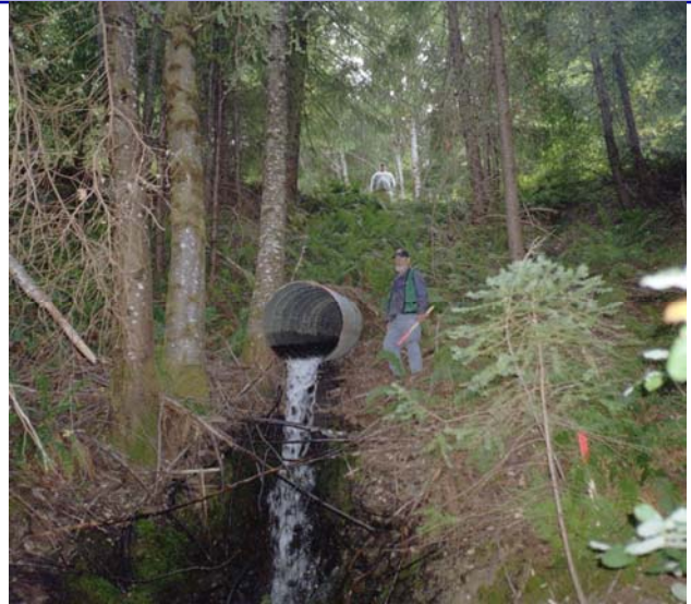
Road decommissioning/culvert removal