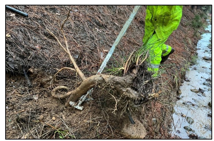
Root crown of a Spanish broom plant pulled on East Weaver Creek Road February 7<sup>th</sup>.

Efforts resumed on the population of Spanish broom located on East Weaver Creek Rd. Root stumps from plants cut back last year were wrenched out. This population is very old and their roots were extremely deep. The area was seeded heavily with erosion control native grass seed mix.