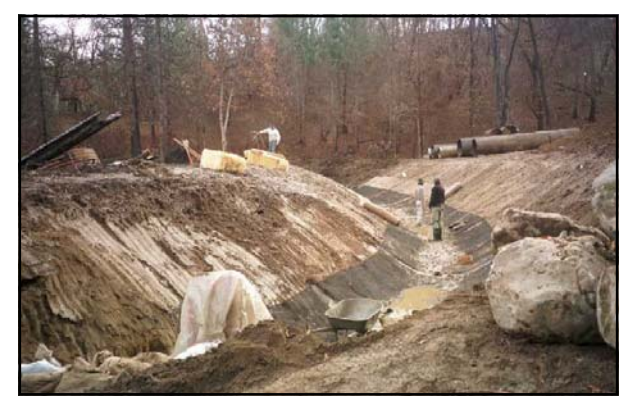
Lowden Fire Drainage Improvement on Landowner's Previous Home Site

BLM officials turned to the Trinity County RCD almost from the beginning of that disastrous weekend. The District opened its offices for BLM to use as a temporary Victims Claim facility throughout the holiday weekend. As soon as the fire was under control that same weekend, BLM consulted District staff. They looked to the District's geologist to get a better understanding of the challenges of stabilizing soils dominated by decomposed granite (DG) and to the revegetation coordinator for her expertise in rehabilitating altered DG landscapes. The Trinity County RCD has extensive experience restoring watersheds with similar conditions, most notably the Grass Valley Creek Watershed where the RCD and BLM have been restoration partners for a number of years.