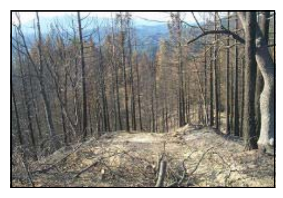
Fire Line Rehabilitation Site

A team of experts from a number of federal agencies in the western states was assembled immediately after the fire. This team, known as the BAER (Burned Area Emergency Rehabilitation) team, had to develop a fire rehabilitation plan for BLM in just a couple of weeks. The team members looked to the RCD and local NRCS staff for technical assistance – help in evaluating the possible effects of the fire on the affected subwatersheds of the Trinity River.