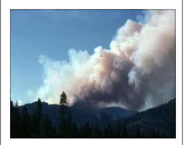
Prevention is the Answer