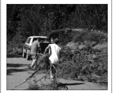
Fuels Reduction Project

A primary function of the Resource Conservation District is to provide assistance to landowners. The District has a solid record of providing the types of assistance that will be needed in the coming months, and possibly years for the rehabilitation of the Lowden Fire burned area. It is the local agency with the expertise in revegetation, soil stabilization, and sediment control. Their experience in the Grass Valley Creek watershed and with decomposed granite is important to the success of the rehabilitation effort. The District has a long history of working closely with the BLM and the other agencies involved in the project. Community outreach and education also have been a critical task to assure that best management practices are used and maintained to protect private property and the natural resources in the area of the fire. Approximately 100 private properties were directly affected by the fire, and the District has the experience and the tools to assist these landowners whether the problem is controlling erosion, restoring a riparian zone or replanting the burned forests, and at the same time they certainly will not miss the opportunity to work with landowners on building a more fire safe community.