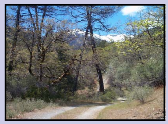
Portion of the West Weaver Creek Trail

Plan was prepared and reviewed in 1999, and will be finalized Spring of 2000.