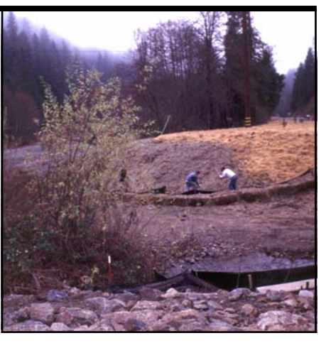
Revegetation Along Highway 299 Following CalTrans Roadwork

The long-term success of any revegetation program relies on evaluating the survivability of planted materials. This year's monitoring included 17 sample sites selected to monitor seedling survivability in the GVC watershed. This included shrub and grass plug monitoring, consisting of flagging 50 seedlings of each species for future identification. Additionally, the District will be monitoring the responses of vegetation to the fire and the success of plantings. An important role of monitoring is to guide replanting efforts in future years.