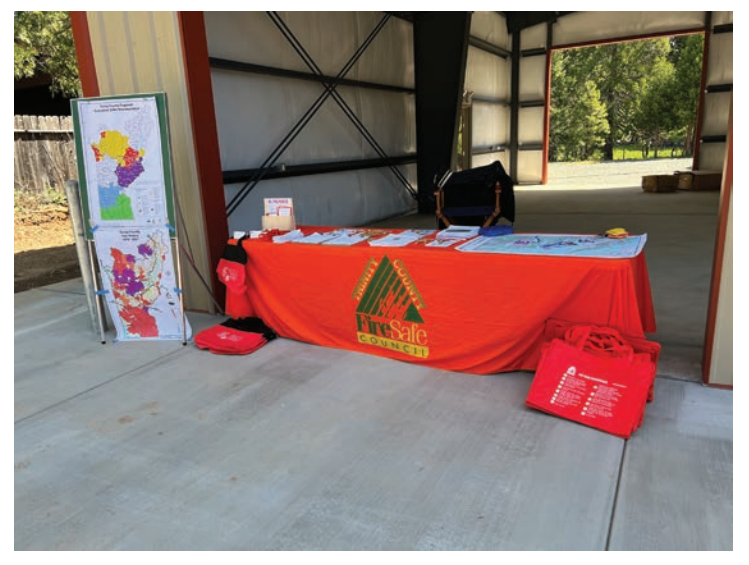
Trinity County Fire Safe Council table at a community event in Trinity Center