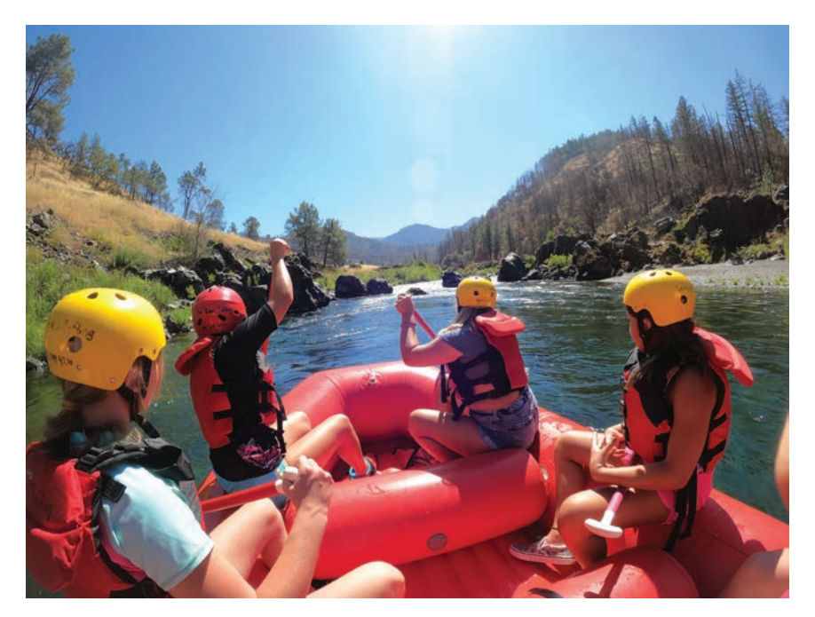
Campers rafting on the Trinity River with 6 Rivers Rafting

Camp was generously supported by the USFS Shasta Trinity RAC, Humboldt Area Foundation, Trinity River Restoration Program, Trinity River Lumber, Holiday Market, Coast Central Credit Union, Friends of the TCRCD, the Young Family Ranch, and private community member donations. Thank you to all who contributed, big or small, to Weaverville Summer Day Camp!