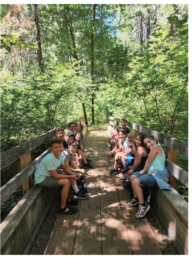
A group of campers, ages 8 & 9, on a field trip at East Weaver Creek