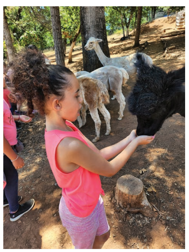
A camper hand-feeding a llama at One Thing Ranch