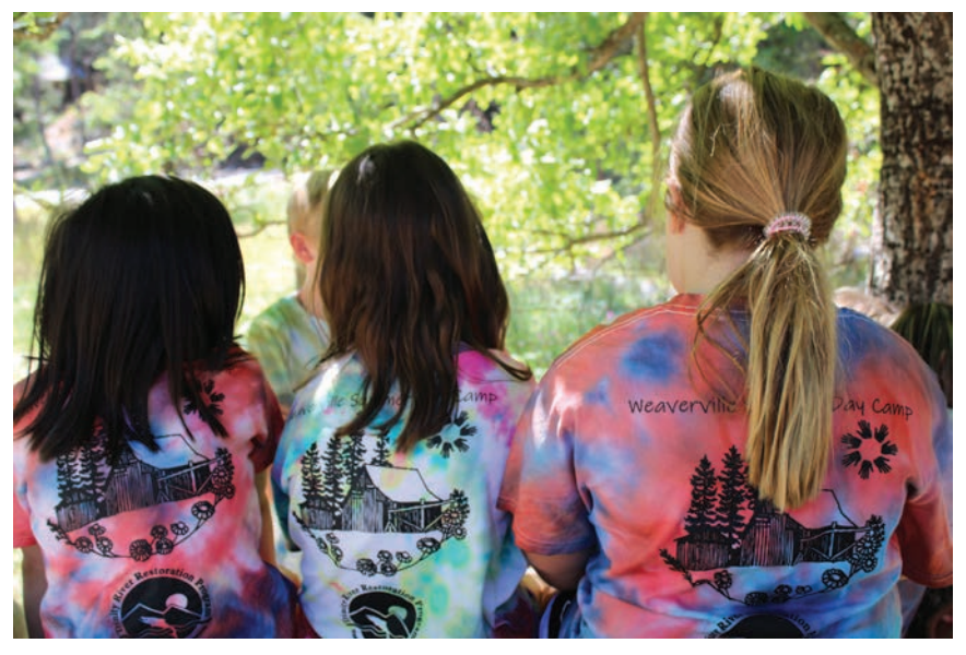
Newly tie-dyed Weaverville Summer Day Camp shirts