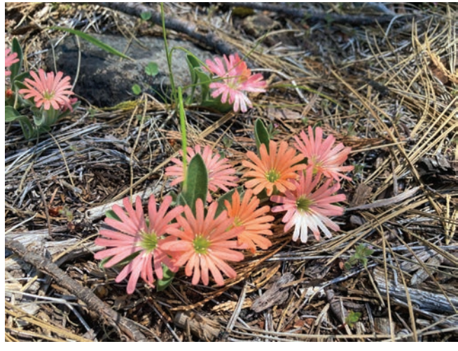
Silene salmonacea (Klamath mountain catchfly), CA Rare Plant Rank 1B.2

Botanical survey work is an invaluable service to provide, as data collected on surveys like this will not only serve its purpose in protecting the intrinsic value of the plants within the project perimeters; it will also help paint the larger picture for each species' health and range for botanists and conservationists across the state. Location information and species population data will be shared through CNDDB. If you would like your property surveyed for rare or endemic species, call our offices at 530-623-6004 to schedule a fee for service evaluation.