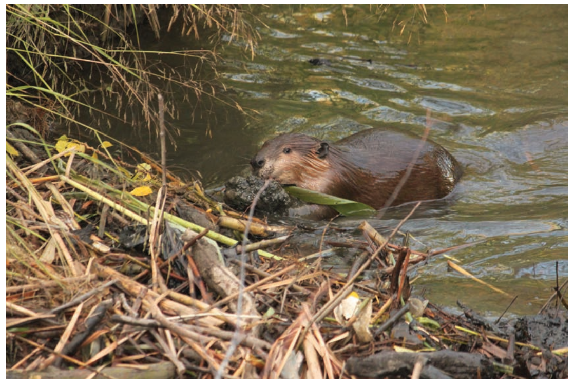
A beaver building its dam.

A. Maybe assessing the stream flows post-implementation and looking at stream connectivity to the flood plain, possibly stream depth. But this is a challenge because dams blow out so quickly.