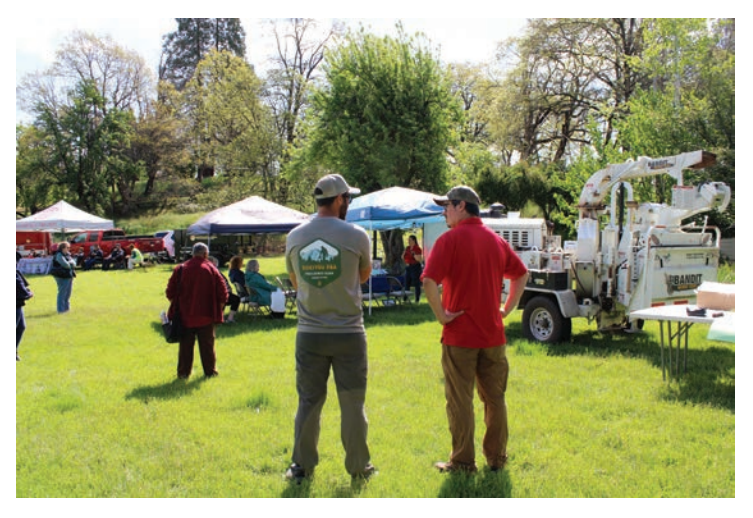
Wildfire Awareness Day Fair at the Highland Arts Center Meadow in May

evacuation preparedness Go-Bags for humans and pets which were available at all recent events. TCFSC partnered with the Trinity County Food Bank to deliver the Go-Bags to residents throughout the County. Go-Bags are available at the TCRCD office if you would like to pick one up. Over 1,500 human bags and 1,000 pet bags have been provided to Trinity County residents from May to July.