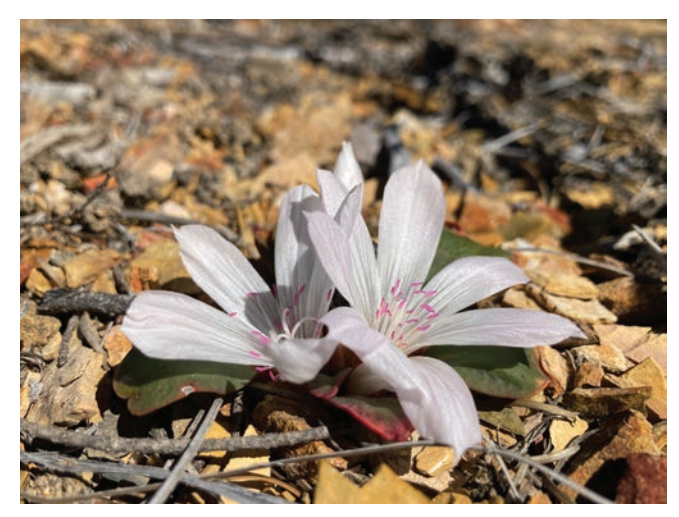
Lewisia kelloggii ssp. hutchisonii (Sierra valley lewisia), CA Rare Plant Rank 3.2