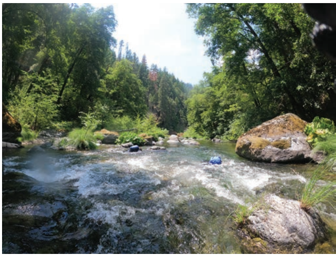
A diver surveying a stretch of the New River on July 27th, 2022

Thank you to the 41 agency representatives and community members that took part in the 2022 Snorkel Dives, including California Department of Fish & Wildlife, the Watershed Research & Training Center, US Forest Service, Yurok Tribe, Trinity River Restoration Program, Hoopa Valley Tribe, National Oceanic and Atmospheric Administration, US Fish & Wildlife Service, and members of the public.