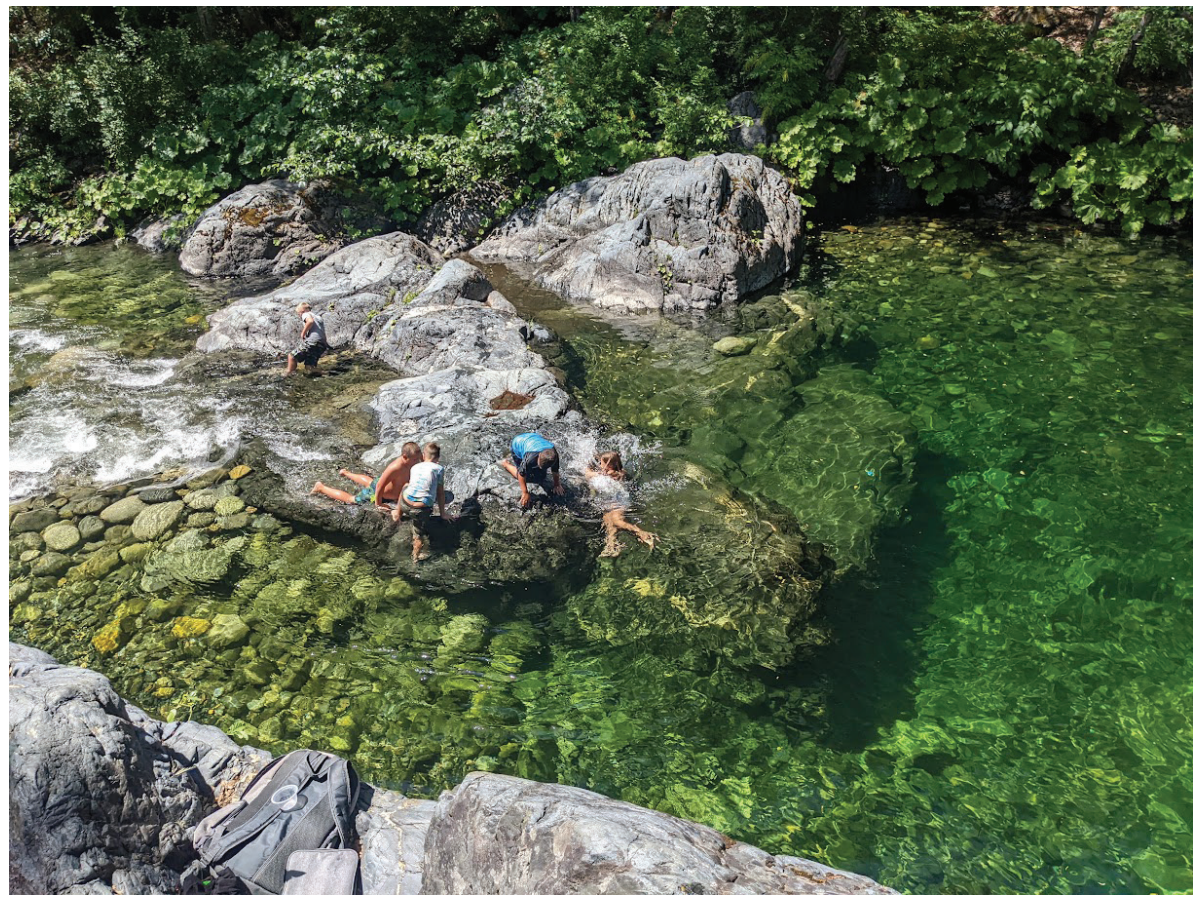
Campers swim and explore on a field trip to Stuart Fork