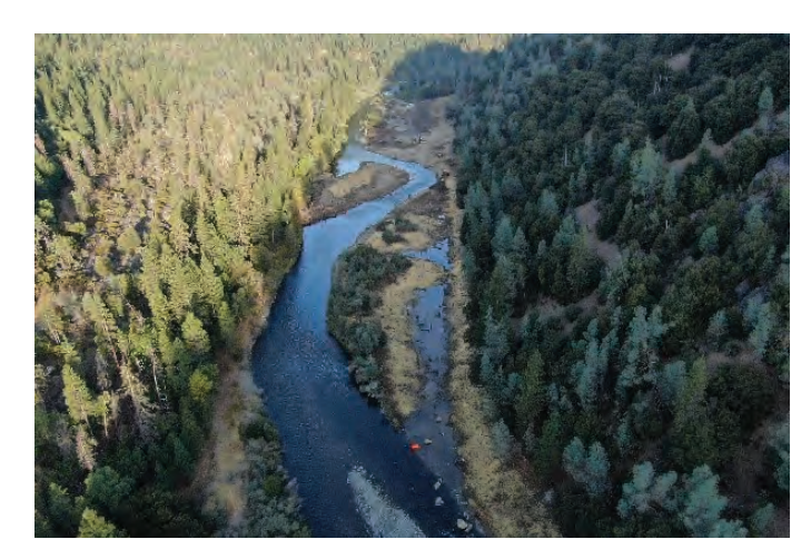
Figure 1. Photo left - Perspective looking downstream at the Dutch Creek project site in 2016. The barren land terraced above the river on the right side of the photo contained predominantly non-native grasses and is largely disconnected from the river. Photo right – 2020 rehabilitation included lowering the floodplain elevation to reconnect it to the river and a new meander bend.