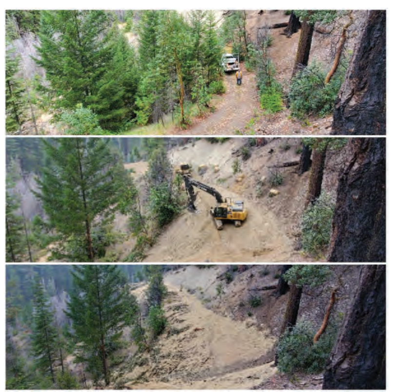
Before, during, and after shots of road decommissioning