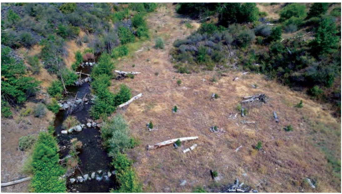
Habitat restoration on West Weaver Creek

For three seasons, native trees were planted, irrigated, and monitored in the West Weaver Creek Vegetation Resiliency Project. The project was completed in 2020 with trees and shrubs showing a final vigor of 88%, which is above average. Vigor is determined by a trained professional assessing multiple observed factors such as damage from herbivory, absence or presence of drought stress, disease presence, coloration, and size. In September, all temporary irrigation infrastructure and protective cages were removed, revealing a beautiful park-like landscape of trees 4 to 7 feet tall.