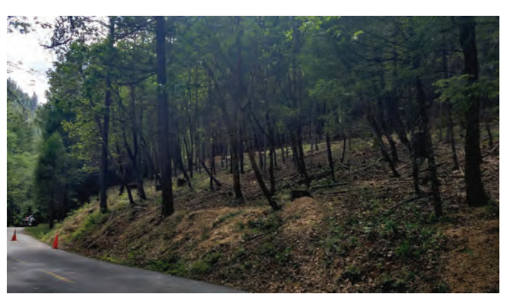
Fuel reduction project in Junction City, before (left) and after (right)