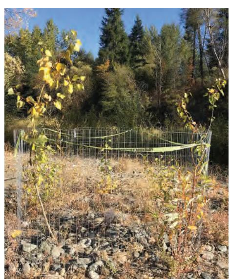
Native trees planted on Hayfork Creek