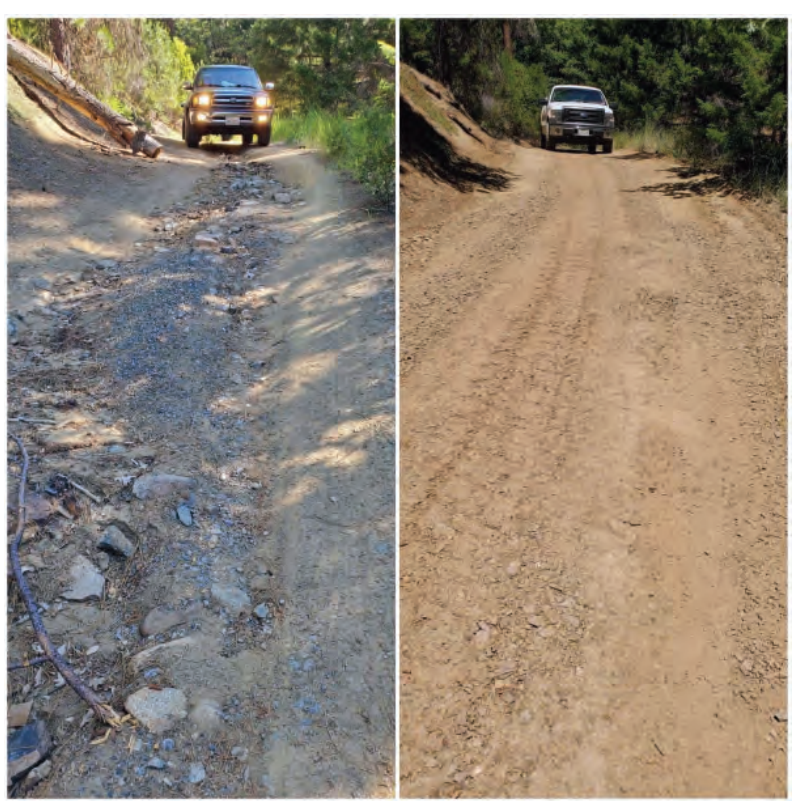
Before and after road improvements