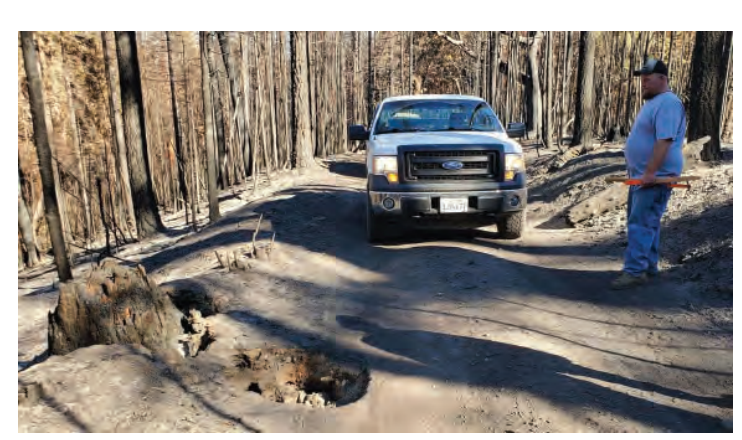
Burned streambed (left) and stump (right) following the 2020 August Complex Fire