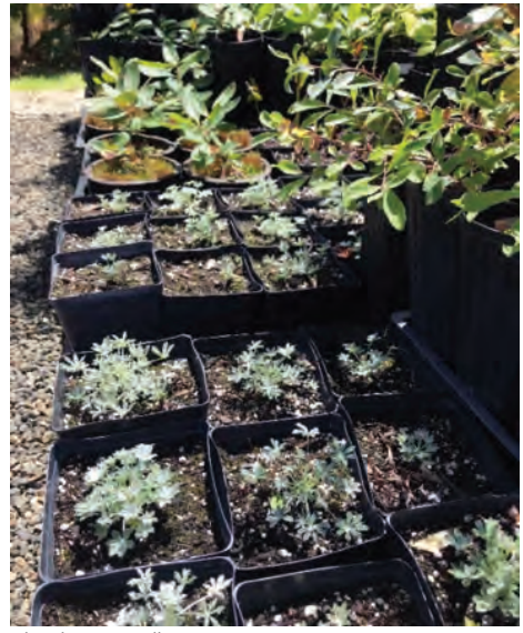
Silver lupine seedlings