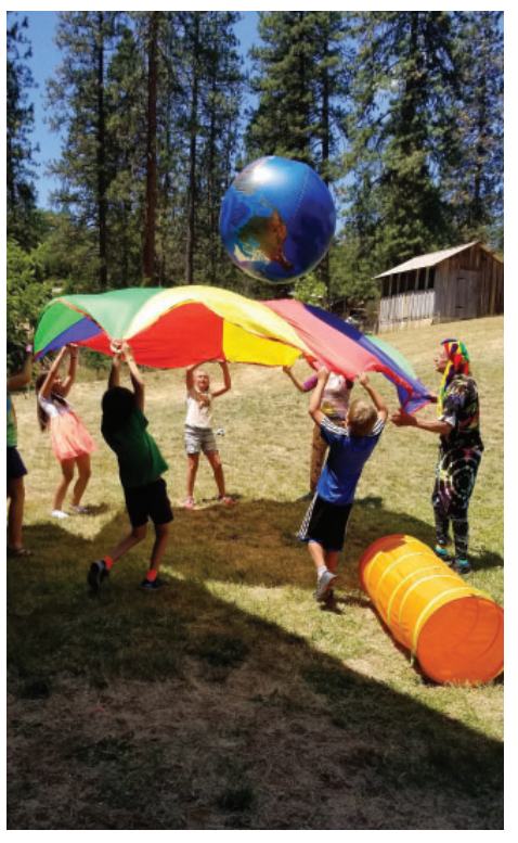
Save the Earth! With Nature Circus at Weaverville Summer Day Camp