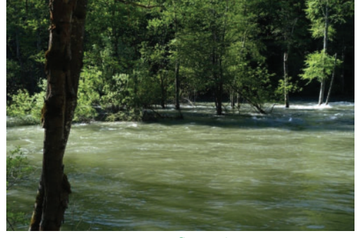
Spring restoration flow release in 2019 had peaks of 9,850, 10,800, and 9,000 cfs

The TRRP coordinated and scheduled a peak release of 10,800 cfs from Lewiston Dam, combined with gravel augmentation at multiple locations along the river, in the 2019 forecast wet water year. Three separate peaks were incorporated in the 2019 hydrograph to efficiently transport sediment and to enhance the ecological productivity of the release timing . Historically, precipitation-driven floods caused flows to vary over the winter and spring, while Chinook Salmon ( Oncorhynchus tshawytscha ) eggs were incubating and fry were growing. These floods inundated floodplains and allowed fry to access off-channel wetted areas where they could grow faster than they could in the main channel. TRRP releases restoration flows as early as possible to reflect the benefits that historical winter and early-spring floods provided to salmonids.