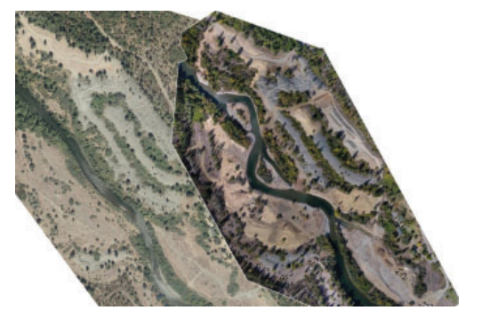
Figure 1. Before & after aerial photographs on the channel rehabilitation project.

12,000 cubic yards of material excavated. The site included three new meanders on the mainstem of the Trinity River, extensive floodplain lowering, and large wood placement to enhance natural river processes (Figure 1). This collaborative project was possible with support from cooperating federal and state agencies, and local stakeholders and landowners. It was implemented by TRRP partners of the Yurok and Hoopa Valley Tribe, and was the first Trinity River restoration project where all equipment operators and laborers were enrolled tribal members.