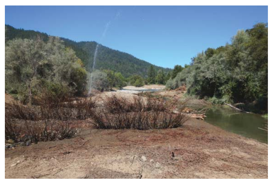
Newly placed willow trenches at the 2019 Chapman Ranch channel rehabilitation project near Junction City.

Other types of revegetation strategies are also employed by TRRP. Over the past several years, revegetation designs have incorporated willow trenches at channel rehabilitation projects to improve river function. Willow trenches are long (up to 100 feet) trenches dug to the water table where willow cuttings are placed very densely (up to 10 cuttings per linear foot). They are