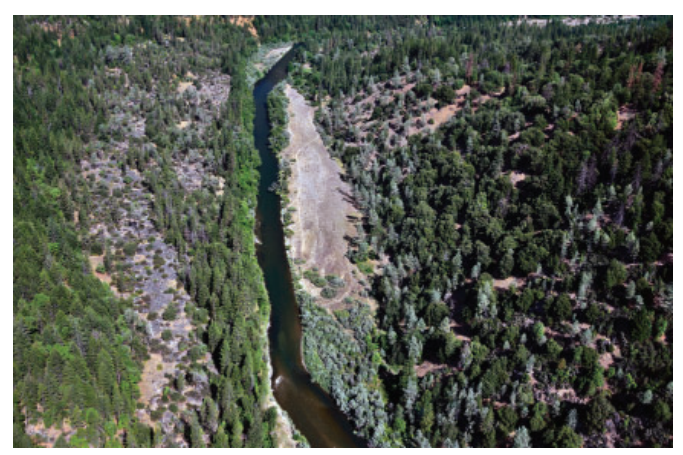
Photo 2. The Dutch Creek site, several miles from the Chapman Ranch site, is proposed for construction in the summer of 2020. This straight stretch of river is cut-off from the floodplain and offers little habitat for young fish, especially during higher flows

Please visit www.trrp.net for more information, technical reports, other products and links to partner and cooperator information.