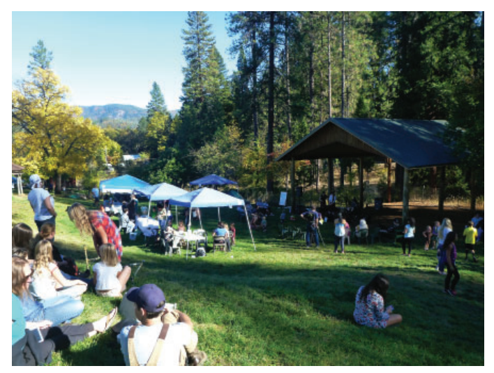
2018 Apple Festival