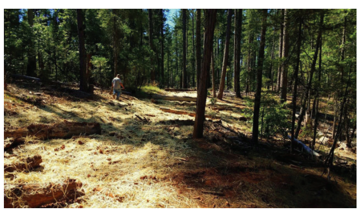
Road decommission on Browns Road