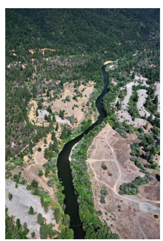
Photo 1. Aerial photograph of the Chapman Ranch site, which is proposed for construction in the summer of 2019

On a highly regulated and managed river like the Trinity River ecological disruption is unavoidable; But with focused and continued effort that works toward maintaining and recovering natural river processes, wild salmon and steelhead can return to the Trinity in strong numbers.