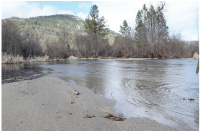
Photo 3. Hamilton Ponds were built to prevent decomposed granite and fine sediment from Grass Valley Creek from building up in the Trinity River