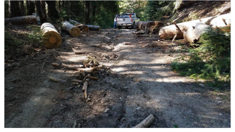
Gully from poor road drainage