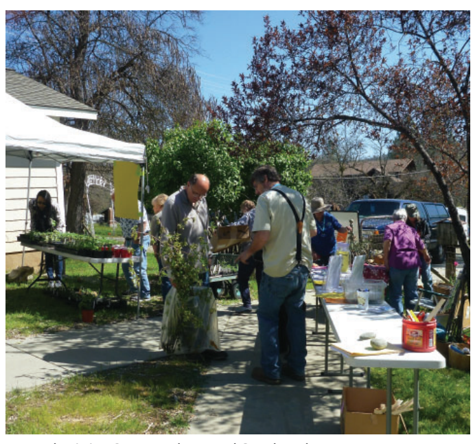
Annual Trinity County Plant and Seed Exchange

This would not have been possible without support from Trinity Trust, Humboldt Area Foundation, UC Cooperative Extension, UC Master Gardeners, UC CalFresh, Young Family Ranch volunteer Board of trustees, and many others who supported these events.