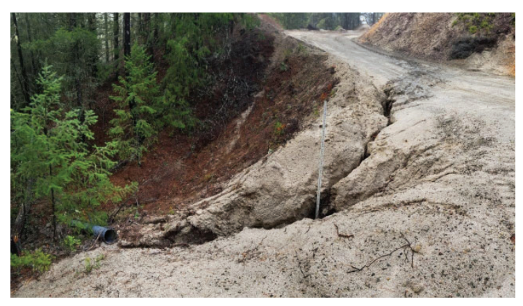
Gully erosion after the Carr Fire