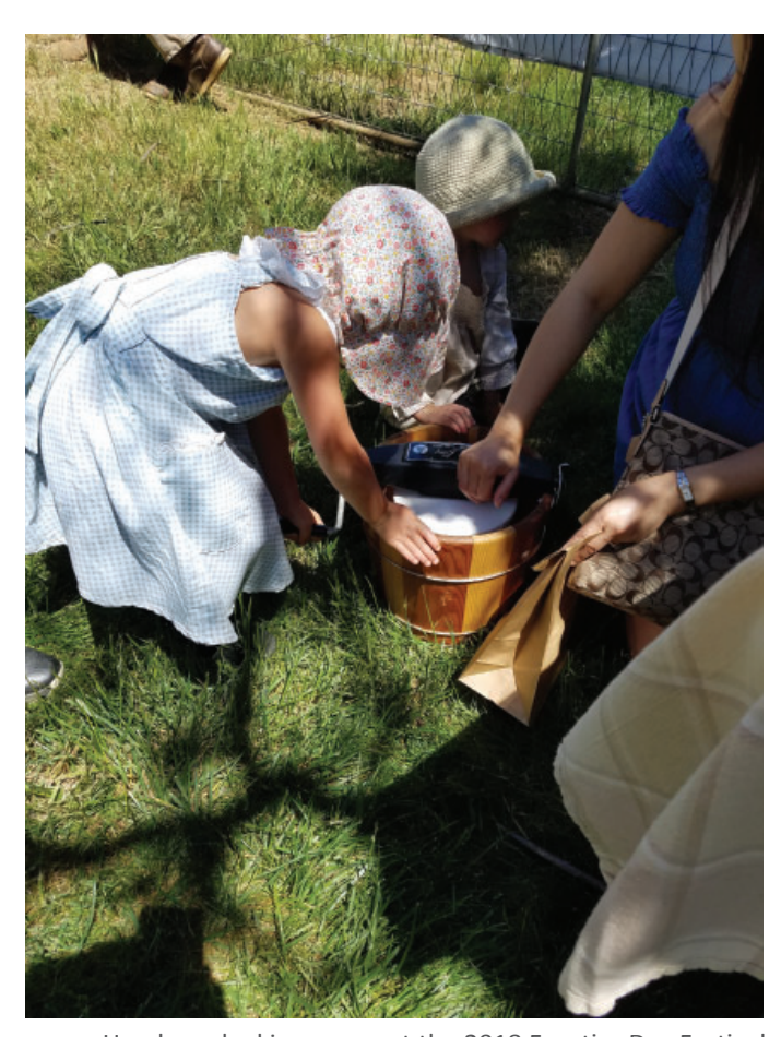
Hand cranked ice cream at the 2018 Frontier Day Festival