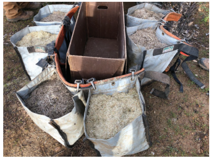
Native grass seed in bags ready for broadcasting

The District's Native Plant Nursery continued to expand in 2018, with generous support from Caltrans. Twenty-four different species of native seed were collected, treated, stratified, and propagated at the nursery, which added valuable diversity for revegetation projects. Plants grown from local seed are more adapted to the harsh climate, poor soils, and unique topography found in Trinity County, ultimately contributing to healthier and more resilient ecosystems.