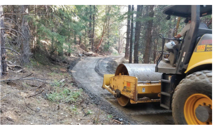
Construction, rocking, and compaction of a rolling dip