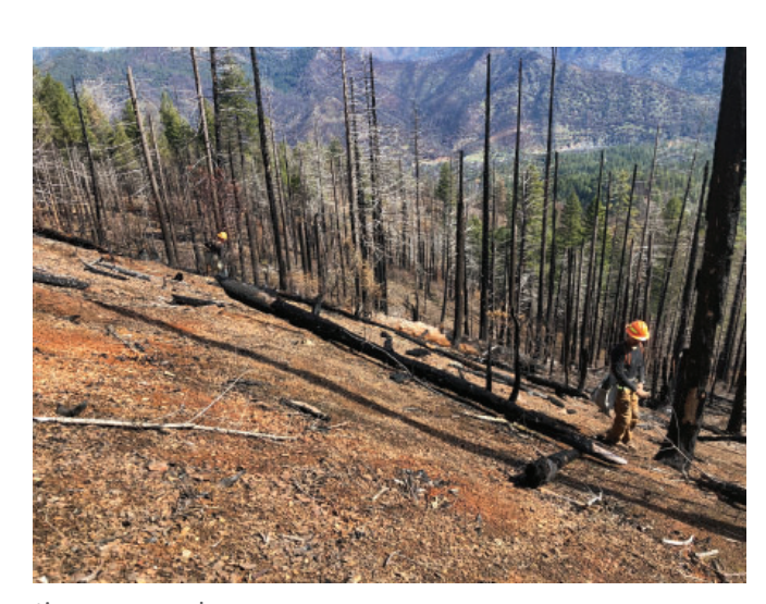
Hand broadcasting native grass seed