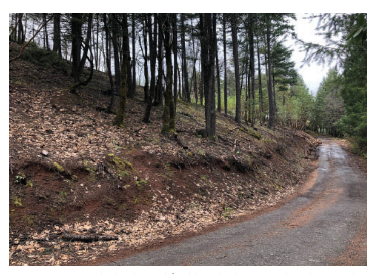
Roadside shaded fuel break along South Ridge Road in the Timber Ridge area of Weaverville

One excellent example of this is the Timber Ridge Community Fuel Break, a 30-acre contiguous project forming a protective buffer around the Timber Ridge subdivision in Weaverville. Once completed, it will provide an anchor point for fire suppression efforts in the Wildland Urban Interface south of Weaverville, and tie in with fuels reduction treatments the BLM is implementing in the Weaverville Community Forest.